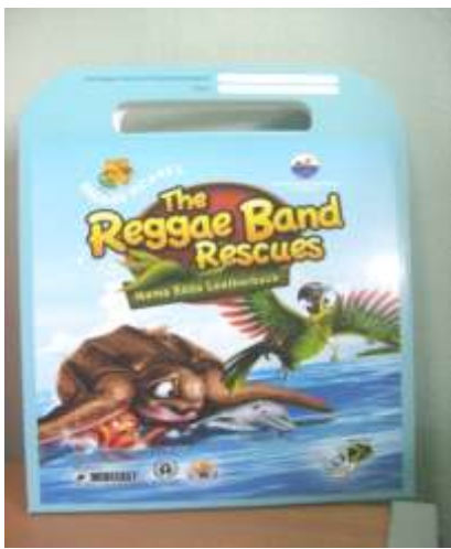
The EFJ supported the production of the latest In the Early Childhood "Shaggy Parrot" Books. The book was designed and tested for Children through a grant to the Dudley Grant Memorial Trust

During the past year the Child and Environment sectors benefited from the publication of two manuals made possible through partnership with EFJ. The first book was produced through the Dudley Grant Memorial Trust and the grant supported the illustration and printing of the Children's CD story book entitled "The Reggae Band Rescues Mama Edda Leatherback". It is geared towards creating awareness among children 0 – 8 years on the importance of effective waste management practices. The second book, produced through the Jamaica Baptist Union, is an Environmental Stewardship Series Manual which addresses the importance of the environment from a faith-based perspective, and highlights how environmental factors impact on the quality of human life.