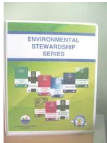
The EFJ supported the Jamaica Baptist Union's Environmental development and production of Stewardship Series Manual which highlights the many synergies between the Christian Faith and Sound Environmental Management.